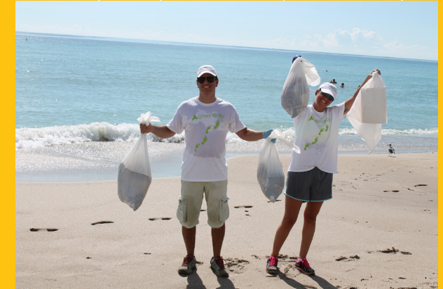
USA Litter picking on Greenfinity Day