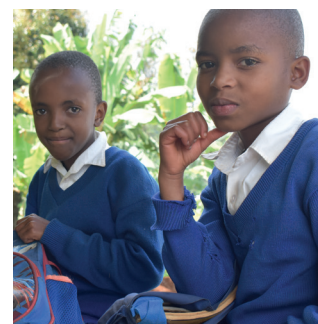
Tanzania Shimbwe Chini Primary School & Sia Shimbwe Primary School

Most of the elementary schools in Tanzania, including those in the Moshi region at the base of Mount Kilimanjaro, have become outdated due to the hot and humid climate and are no longer safe places for children to learn. To address this issue, the Child & Family Foundation, together with the aid organisations Enjetare and C-re-aid, took the initiative to renovate two schools in the region: the Shimbwe Chini Primary School and the nearby Sia Shimbwe Primary School, both of which are attended by 250 students. Despite the challenging conditions posed by the COVID-19 pandemic, the renovation work at both schools was completed in the summer of 2020.