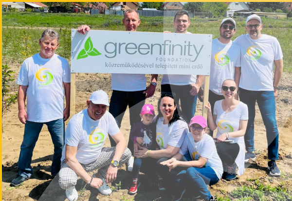
Hungary 1,000 trees for climate protection