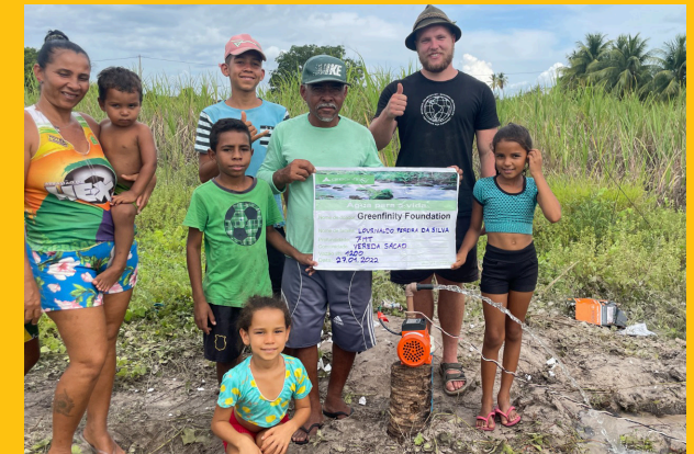
Brazil New wells for Bahia