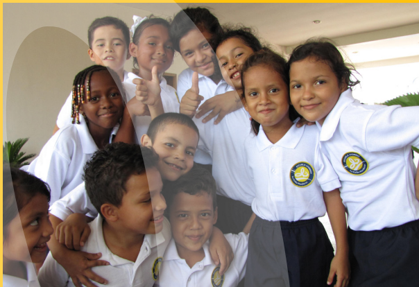
Honduras Centro Educativo CFF