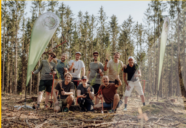
Europe Reforestation of European forests