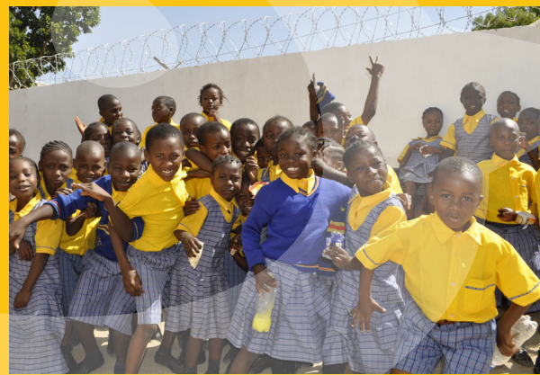
Nigeria Amina Zwindila Foundation School