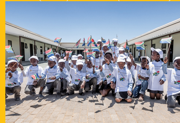
South Africa Nelson Mandela No-Moscow Primary School