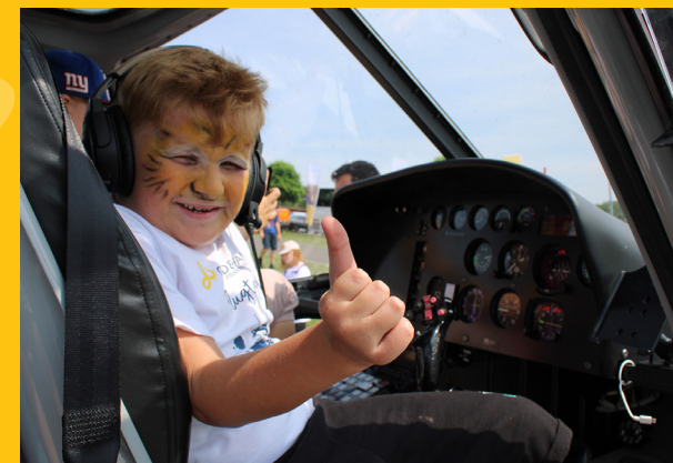
Austria Children's Flight Day