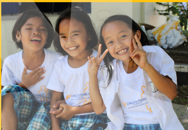
Philippines San Roque Elementary School