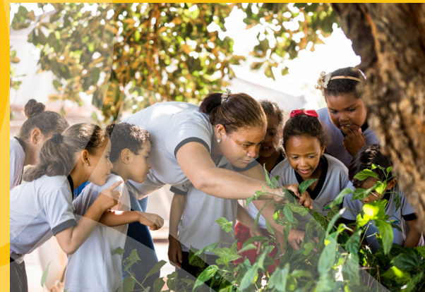
Brazil Greenfinity Forest: saving the rainforest