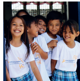
Philippines San Roque Elementary School

In the Philippines, having a roof over one's head, enough food and drink, and access to education for children cannot be taken for granted. That is why the Child & Family Foundation has been supporting the San Roque Elementary School on the southern part of the island of Leyte since 2011, providing primary school education, one hot meal per day, and a brighter future for around 350 children. Over the years, the foundation has extensively renovated the school, transforming it from a rundown building into a modern, disaster-proof institution with an excellent reputation nationwide.