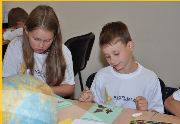
Germany Angel for a Day