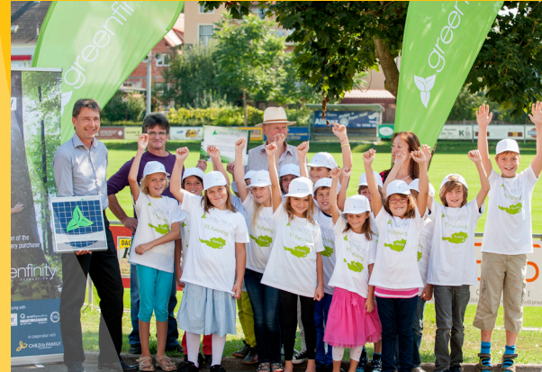
Austria One m² of photovoltaic per student