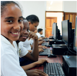
Honduras Centro Educativo CFF

neighbourhoods, making it one of the Child & Family Foundation's largest and most elaborate school projects. The organisation covers all day-to-day costs of the school and strives to provide students with modern teaching resources, including infrastructure, school materials, laboratories, and computers. Centro Educativo CFF has become a very popular educational centre among students, teachers, and parents. In November 2021, the school celebrated its first graduates.